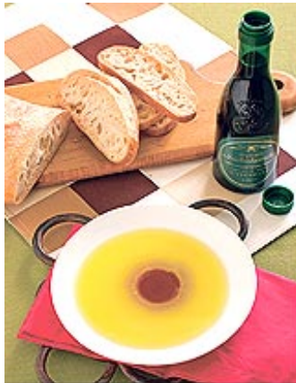
A "bull's eye" of pumpkin-seed oil in olive oil.

Pumpkin-seed oil is made from green pumpkin seeds that are dried, lightly roasted and pressed. Much of the artisanal oil on the market comes from Styria in southeastern Austrian province where the pumpkins grow and the oil is a cultural tradition. It has an unusual color -- green with red highlights -- and a deep roasted, nutty flavor.